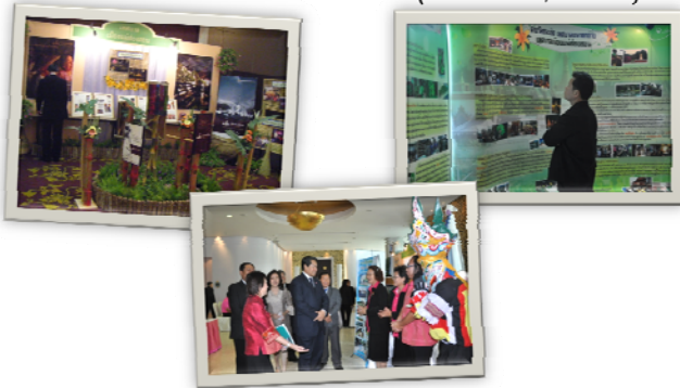
Exhibitions from the winners