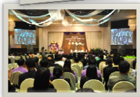
Inside the hall