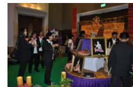
Exhibitions from Mae Hong Son