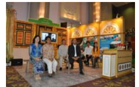
Exhibition from Phuket