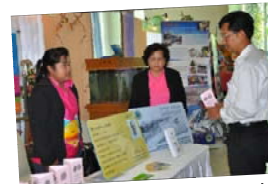
Senior Citizen ID Card